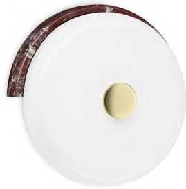
21311 Burgundy | White H: 18 x W: 19 x D: 7 cm