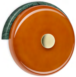
21302 Moss | Amber H: 18 x W: 19 x D: 7 cm