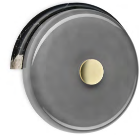
21344 Ash | Grey H: 18 x W: 19 x D: 7 cm