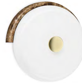
21331 Dark Emperador | White H: 18 x W: 19 x D: 7 cm