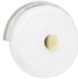
21321 Carrara | White H: 18 x W: 19 x D: 7 cm